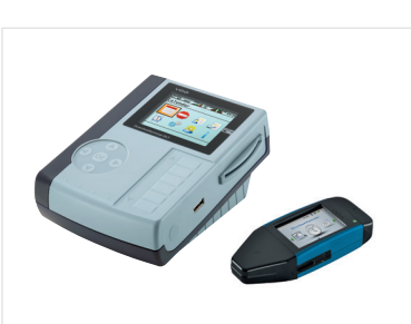
Downloading of driver card and mass memory data